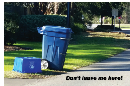
Don't leave me here!

Myrtle Beach's residential solid waste staff begins work at 6:00 a.m. weekdays, collecting trash, garbage, recycling, bulky junk and yard waste from curbside. City code requires that bins or rollout containers for solid waste and recycling be placed at curbside in time for your collection on the designated pick-up day.